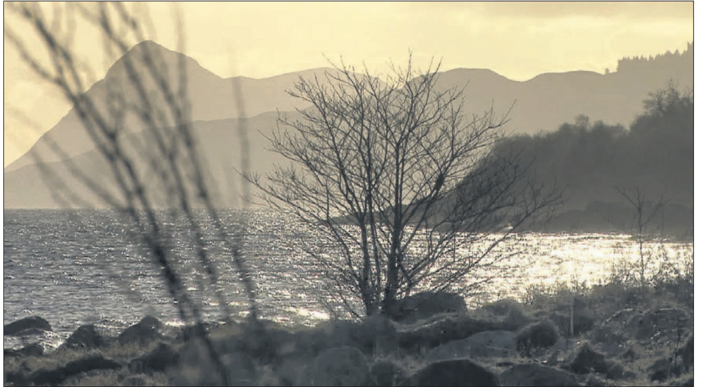
One of the views in the Arran Seasons film.

• Do you have a story for The Arran Banner? Call our reporters on 01770-302142