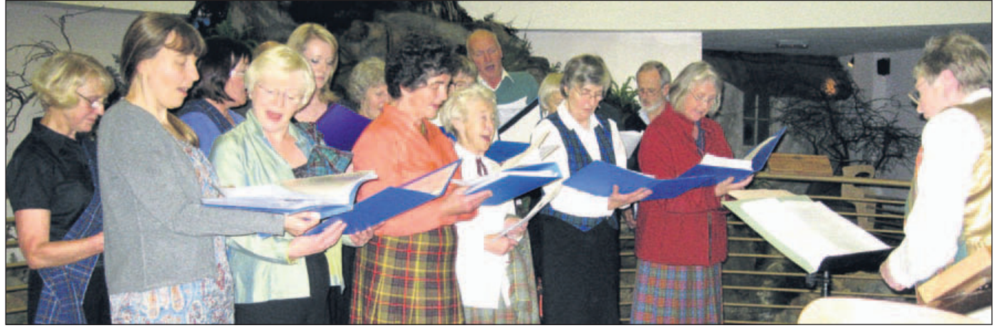
Lochranza Choir performing recently at Isle of Arran Distillery. b49dis01no

'There was a good mix of authors and plenty of audience participation. It was really worth the bumpy boat trip across to the mainland.'