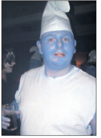
Donald Bannatyne dressed as the ultimate 80s kids TV cartoon character - a Smurf.