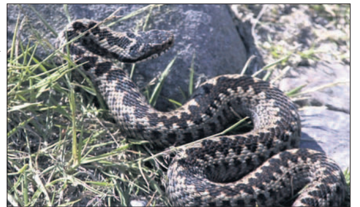
An adder basking in the Arran sunshine.

The DVD is available at the Harbour Shop, Blackwaterfoot, Made in Arran, Lamplash and the Book and Card Centre, Brodick.