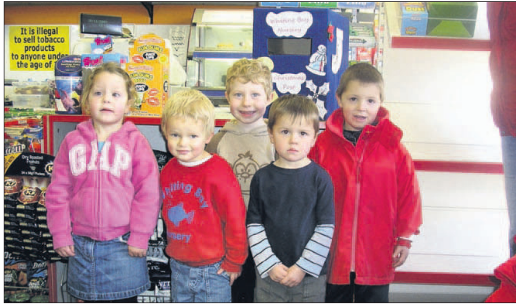
Children of Whiting Bay Nursery group in Bay Stores with one of the post boxes they helped to make and decorate.

'The public are asked to follow any signs and we apologise for the inconvenience caused.'