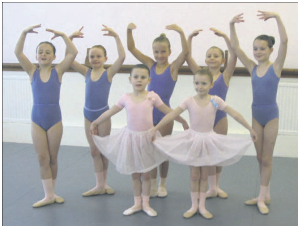
The seven Arran Dancers who travelled to Ayr for ballet exams.