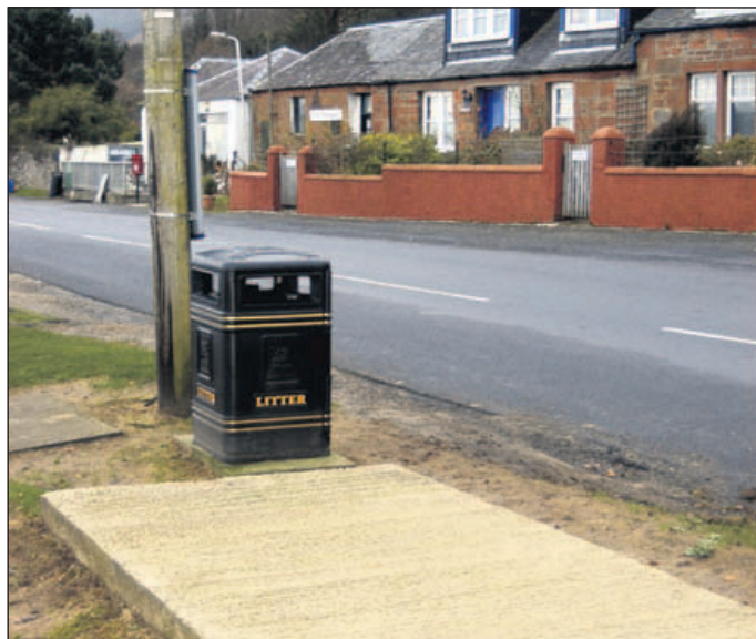
The concrete plinth at the bus stop in the centre of Corrie should soon have a new shelter. 01_b49bus01