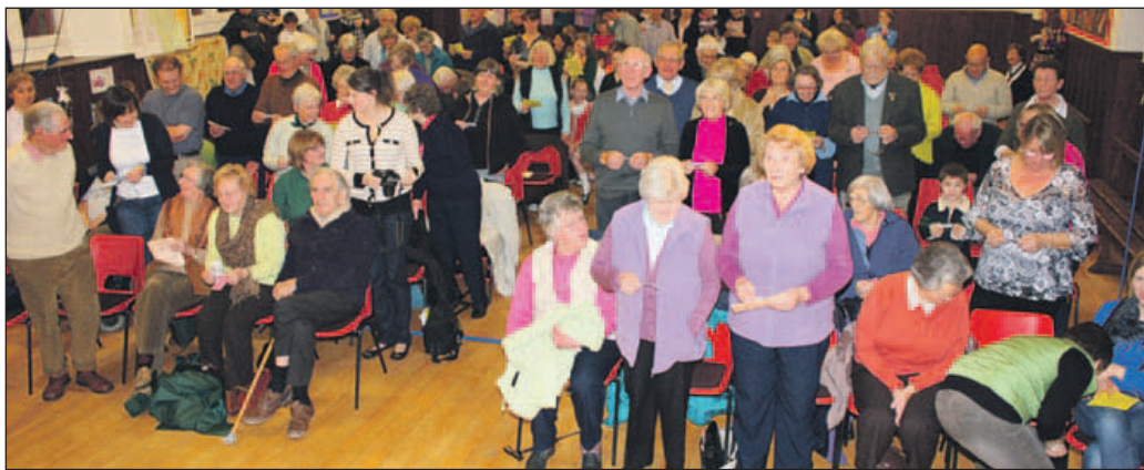
A huge crowd of Shiskine residents and friends of the hall from all over the island gathered for the celebratory concert.

'She is always trying to improve the hall whether it is just fundraising to put in a new floor or buy new curtains. This hall owes her a great deal.'