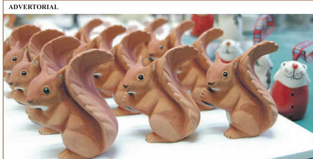
March of the red squirrels. 02_b49red01