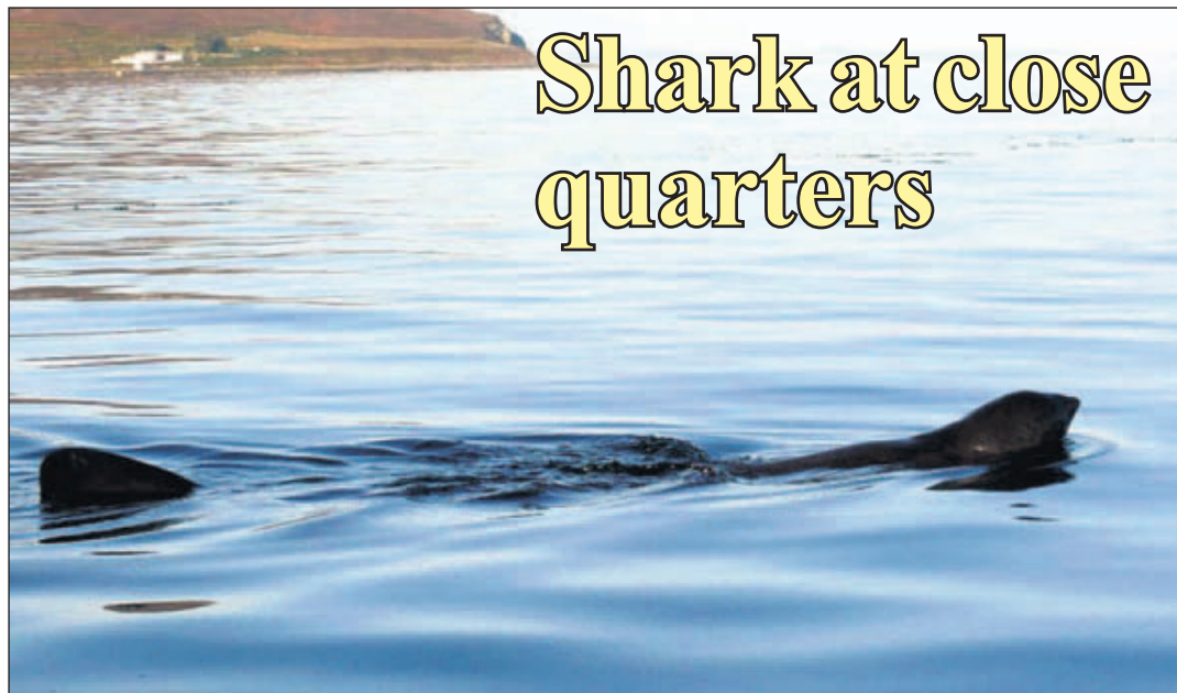
A basking shark just feet away from Tim Hodkinson's boat.

A basking shark was seen at very close quarters last week by Tim Hodkinson of Whiting Bay.