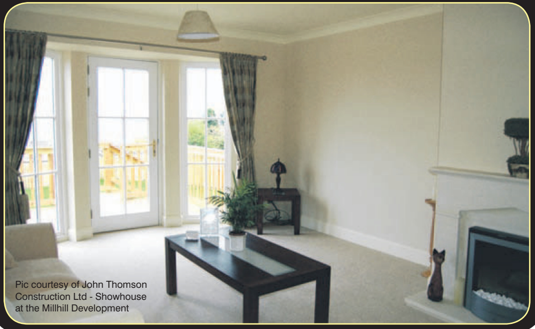
Showhouse at the Millhill Development

Why not invest in a comfortable new sofa and stylish flooring or decorate the bedrooms and choose co-ordinating curtains and cushions. You can create a unique look to your home by choosing unusual mirrors, pictures and clocks. If you are on a tight budget, simply add a few beautifully scented candles as this will give your home an inviting and pleasant atmosphere.