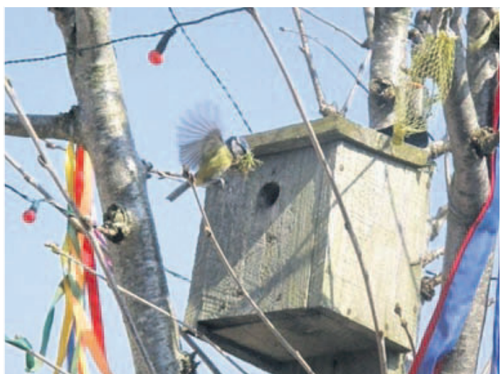
Wing in motion. Maurice Crisp, Lamlash.