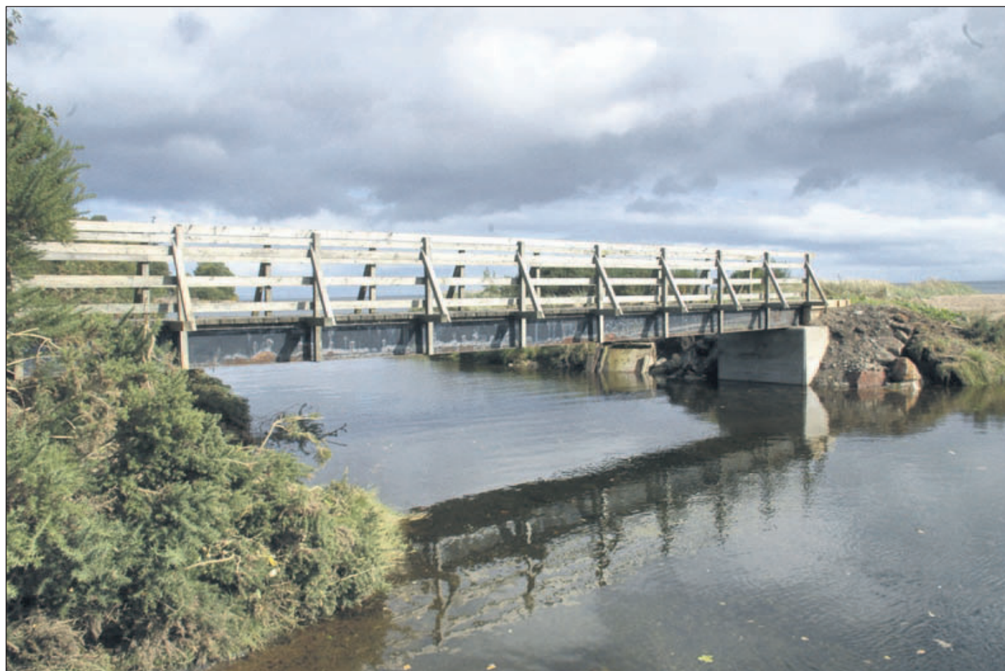
The Cnocan Bridge, re-instated this week. 02_b39fis02

'As stated in a previous Arran Banner, AAT will be pleased to encompass the work of the Arran Coastal Way Group once