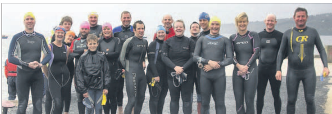
The assembled group of swimmers on Lamlash pier.