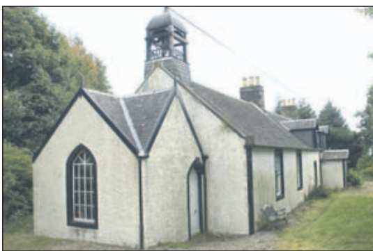
Sannox Congregational Church in its picturesque setting. 02_b39cor01

He was awarded the Ali Bodie Memorial trophy for the person showing most character, and it takes a lot of character for a young man to swim the 1.3 miles of open water across the bay. Twenty-five others, all adults, also completed the challenge. See page 20.