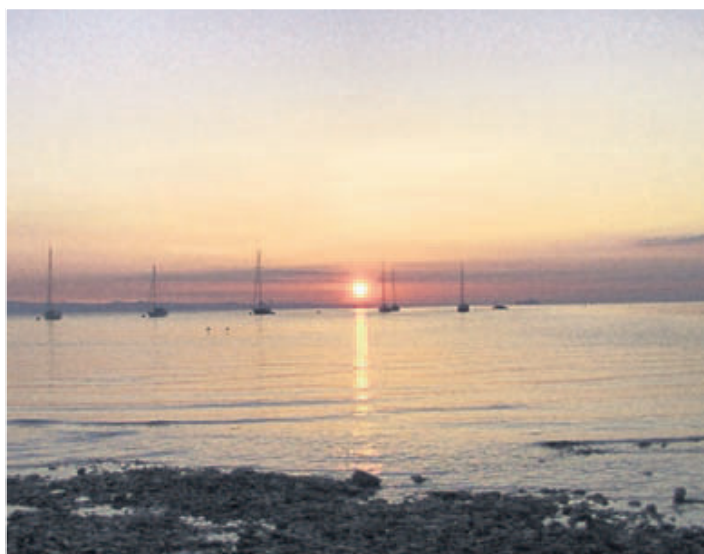
Morning sunrise. Ian Pyott, Brodick.

This week's selection demonstrates that people are obviously incorporating photography more and more into their everyday lives as they capture interesting scenes they see each day.