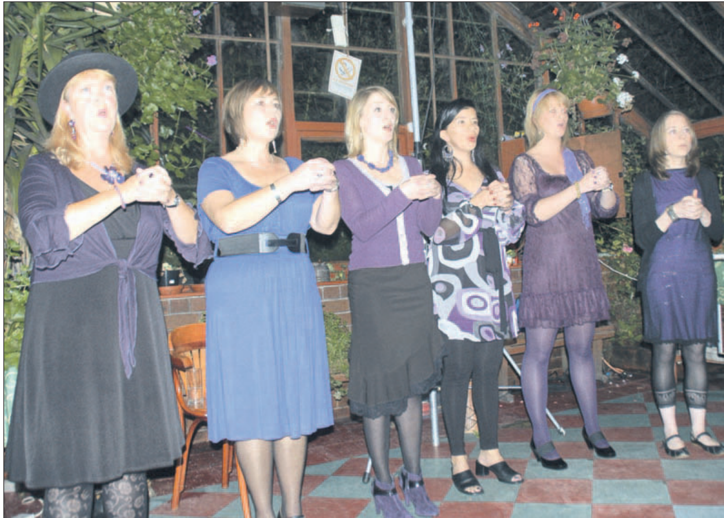
The Wild Myrtles a capella group in the Ormidale Glasshouse. 02_b39fes02