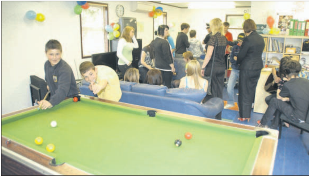
The lounge area of the Youth Cabin.