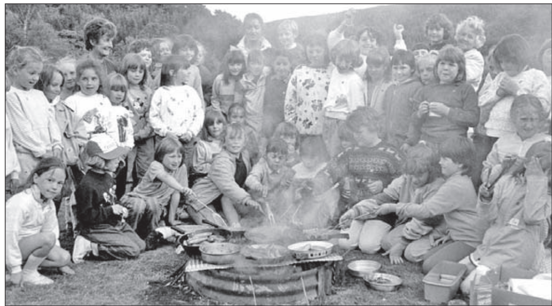
Above: The Brownies are 75 years old this year and to mark the anniversary, Brownies from all over the island met at the campsite on the Ross Road for a sausage sizzle and fun night. b26twe05