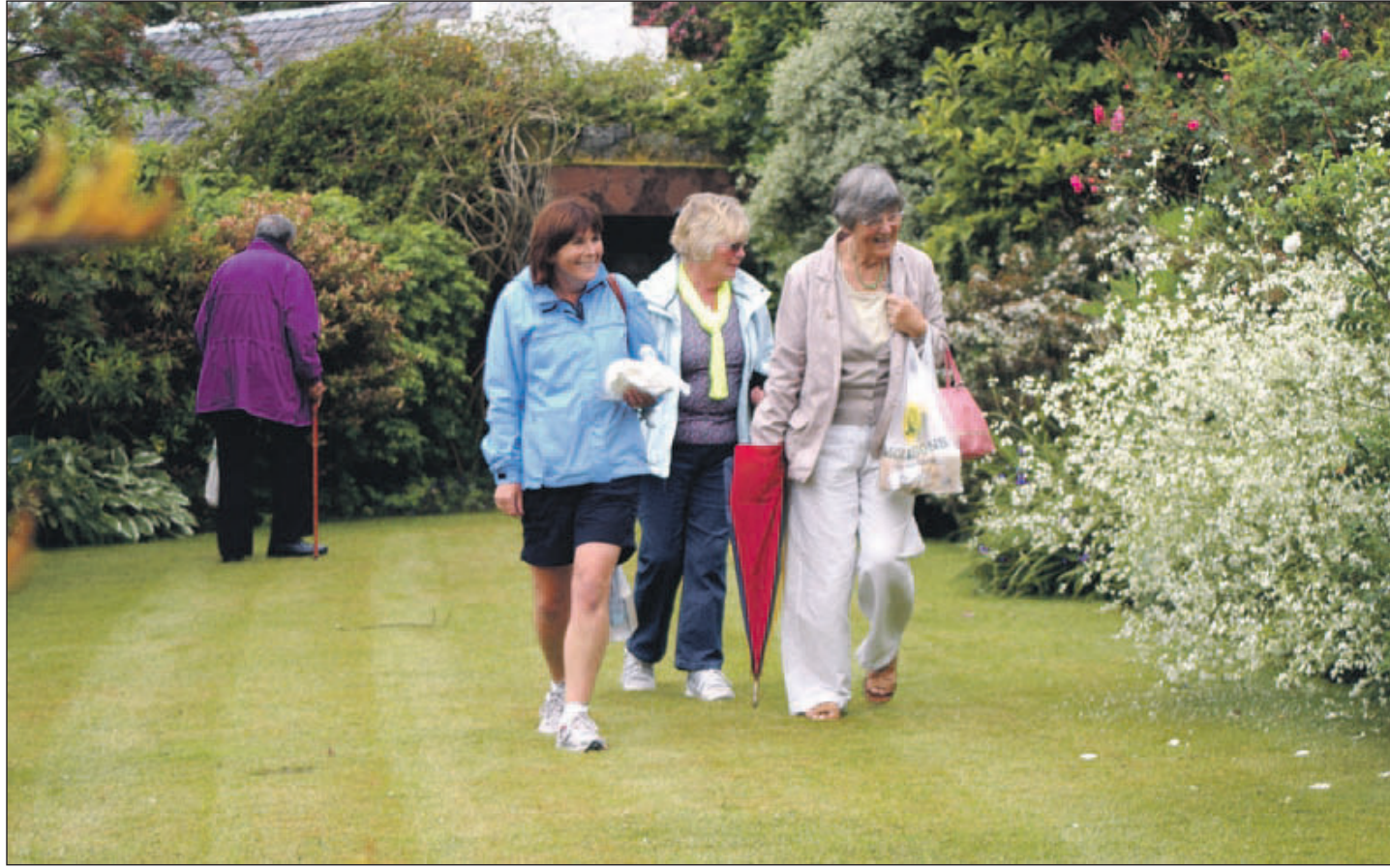
Some ladies from Whiting Bay enjoy a stroll around the magnificent gardens at Dougarie on Sunday. 01_b26gar03