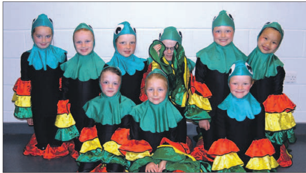
A group of little dancing toads. 01_b26dan01