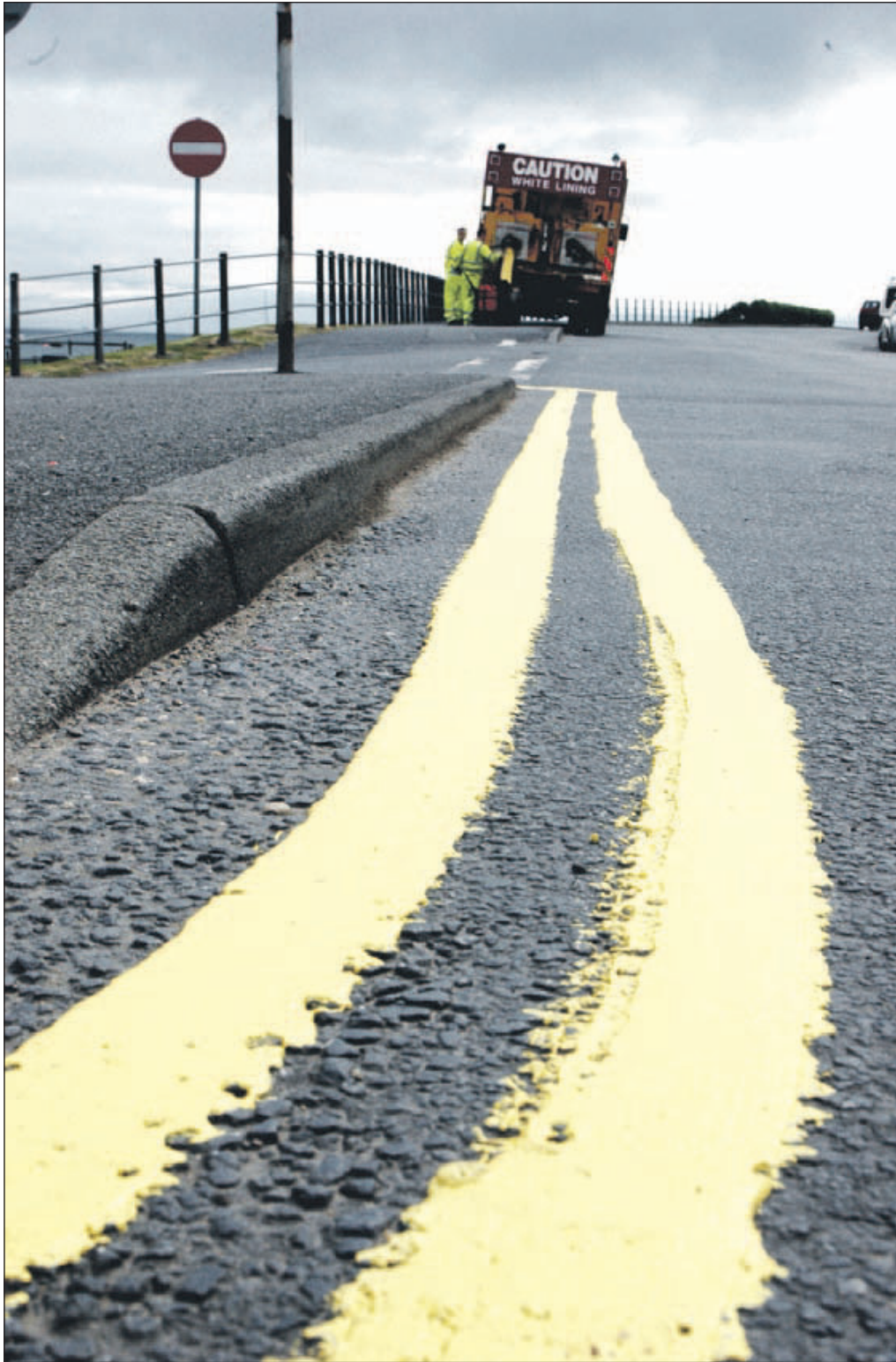
Arran's first double-yellow lines were painted onto the road in Brodick this week. 02_b26lin01

A North Ayrshire Council spokesman said: 'No other locations on Arran are presently under review for yellow lines.'