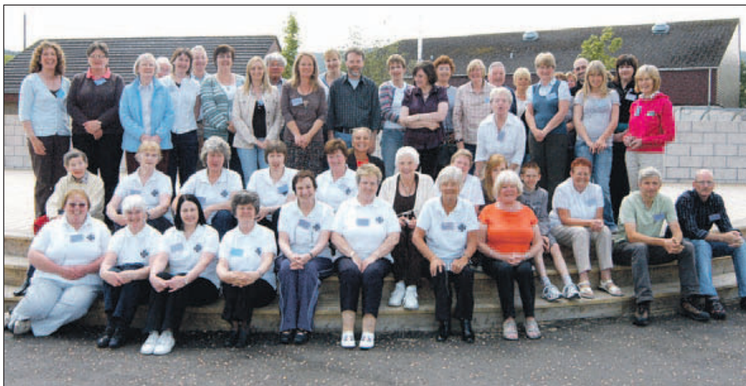
Arran delegates and North Ayrshire Council Community Learning and Development staff at the Gaelic language workshop in Arran High School last Saturday. 02_b25gae01