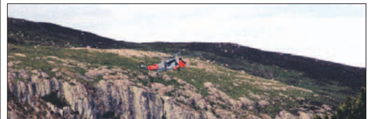
A Sea King helicopter uplifting the stranded student from the slopes of Holy Isle on Monday. 02_b26res01

A 37-year-old Brodick man was reported at Brodick pier at 4.15pm on Sunday for causing an obstruction on the roadway and failing to notify DVLA of a change of address.