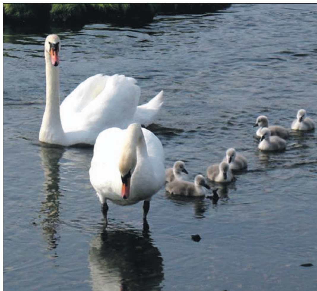
A pair of mute swans with cygnets. b26swa01no

As the Royal Photographic Society state - 'There is one