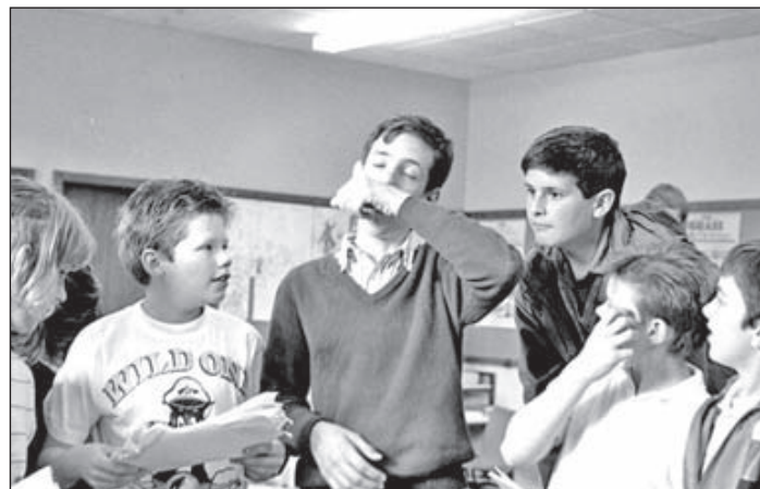
First and second year pupils at Arran High School rehearse the school musical 'Carrots'. b21twe04