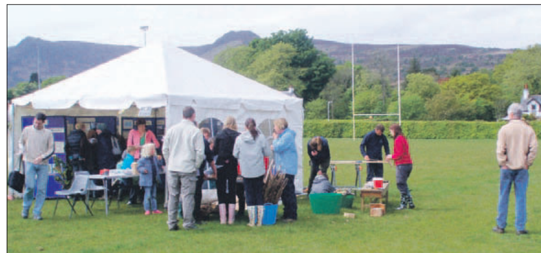
Tents sprang up on the Ormidale Park in Brodick on Sunday as the Wildlife festival held a fun day for youngsters and their families.