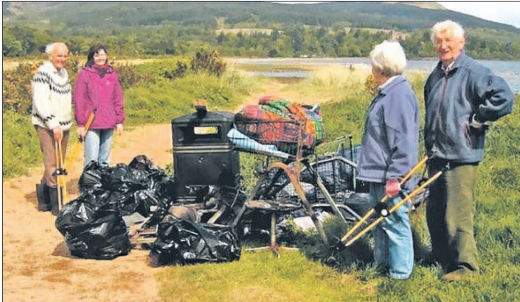
Members of the Brodick Improvements Committee with just some of the rubbish collected from the beach on Sunday.