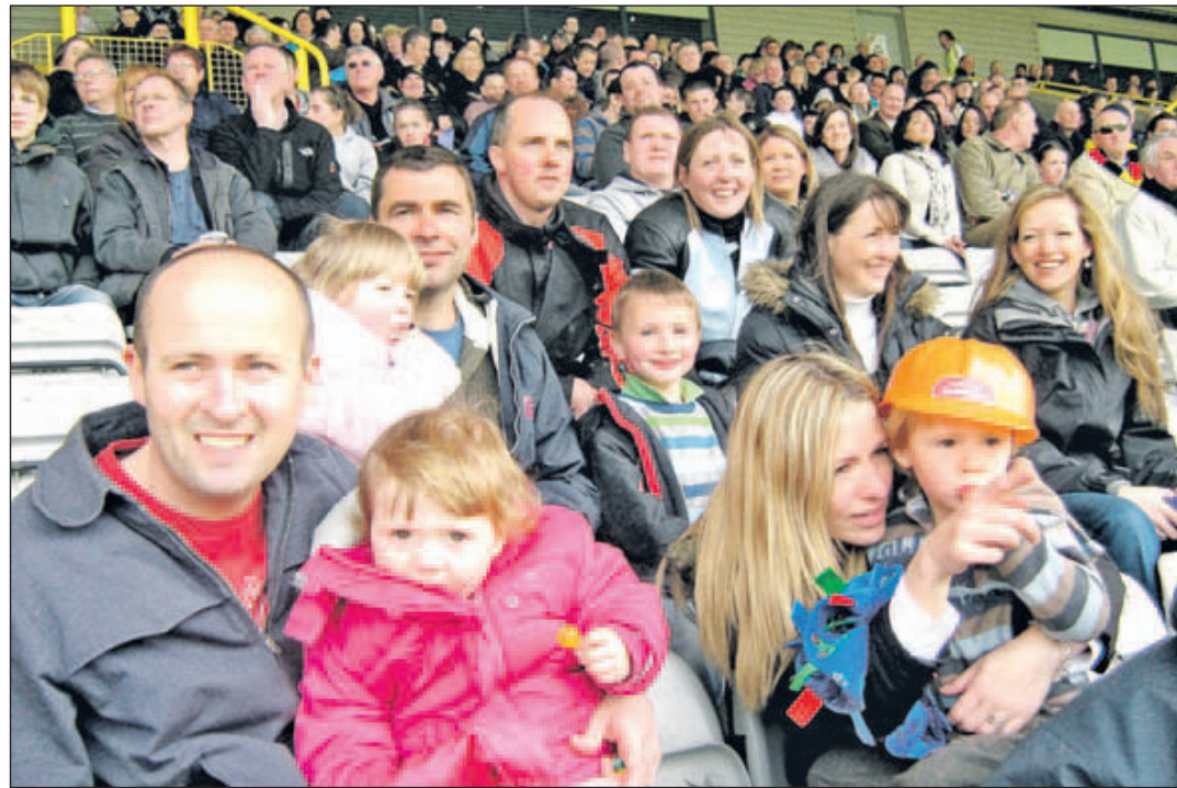
Family and friends from Arran in the crowd. b21soc02