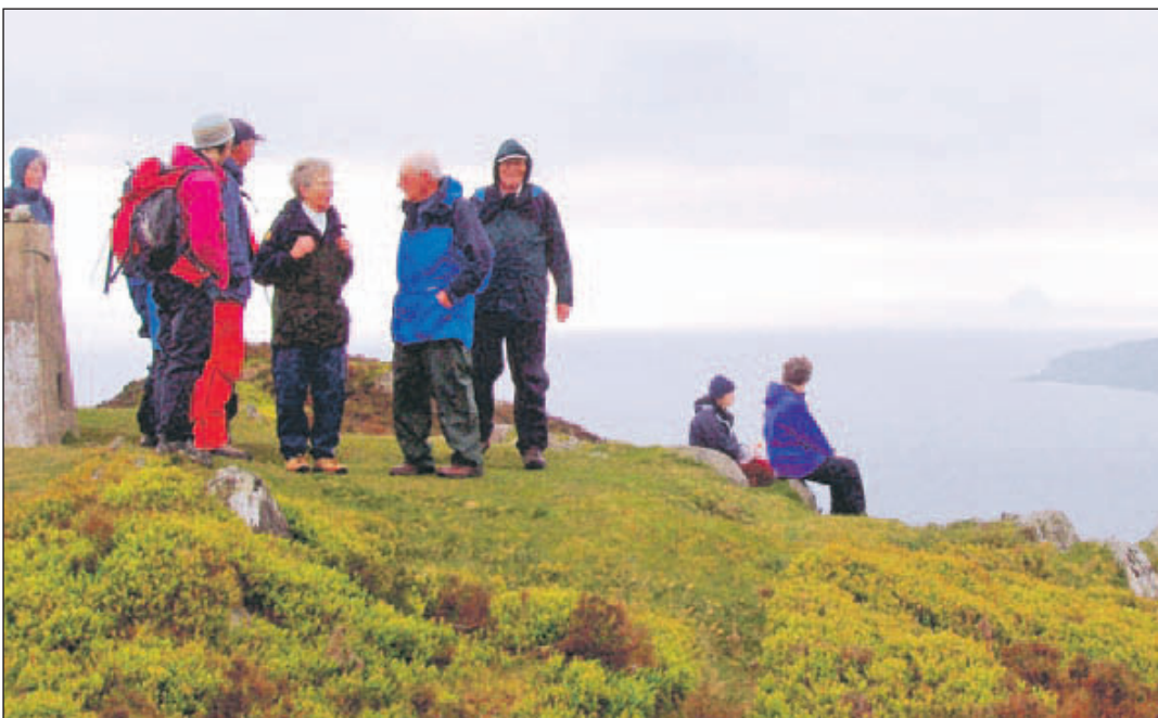
On the summit of Holy Isle with members of the Community of Arran Seabed Trust (COAST).