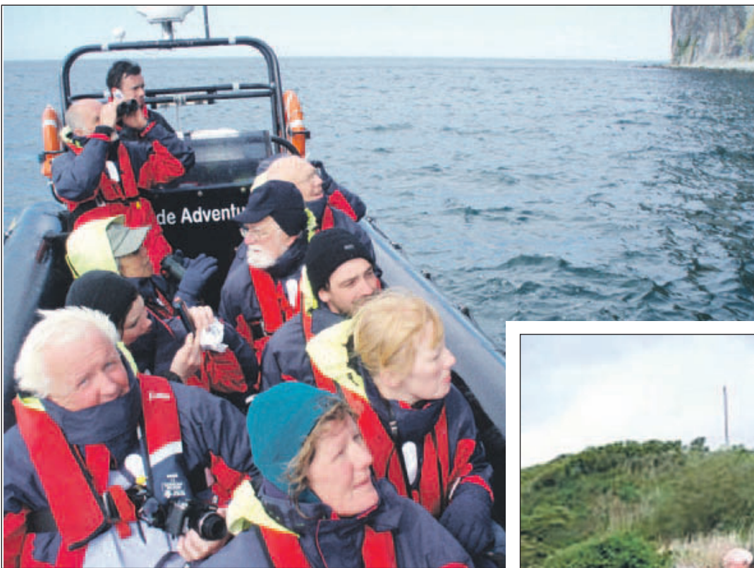
Seafaring wildlife watchers on board Arran Power and Sail's RIB view the birdlife on Ailsa Craig.

Hundreds of visitors flocked to Arran this week for the fourth Arran Wildlife Festival and were treated to over 70 events all over the island and some very special wildlife sightings.