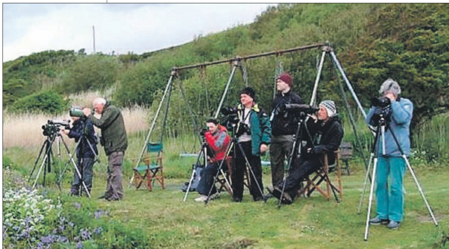
Sea-watchers take up their stance on the Silver Sands at Kildonan to keep an eye on the sea.

Members of the Community of Arran Seabed Trust (COAST) were involved with a number of events during the festival, including an excep-