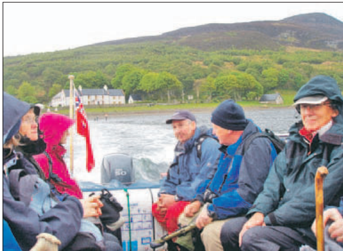
Wildlife lovers on board the Holy Isle Ferry with members of COAST.