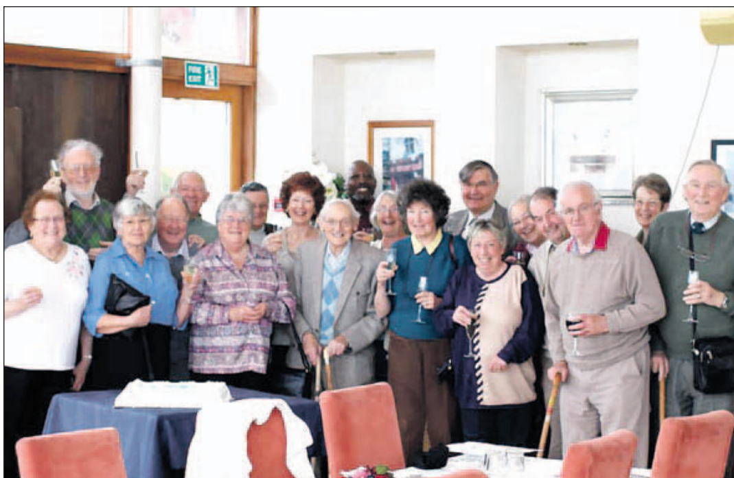
Twenty members of the Lagg Lunch Club attended the 100 th meeting at Kildonan Hotel recently. b21lag01NO