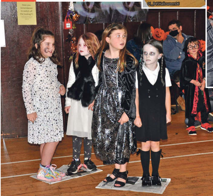
Left: A ghoulish gathering of girls enjoy a dancing statues game at Shiskine.