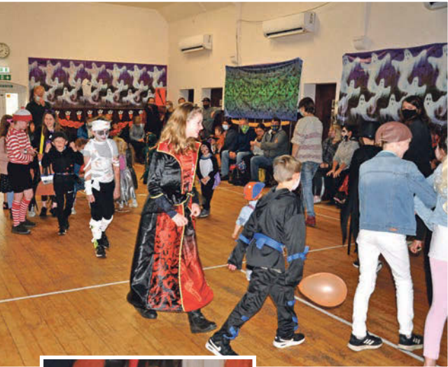
Above: Shiskine children impress the judges during the Hallowe'en parade.