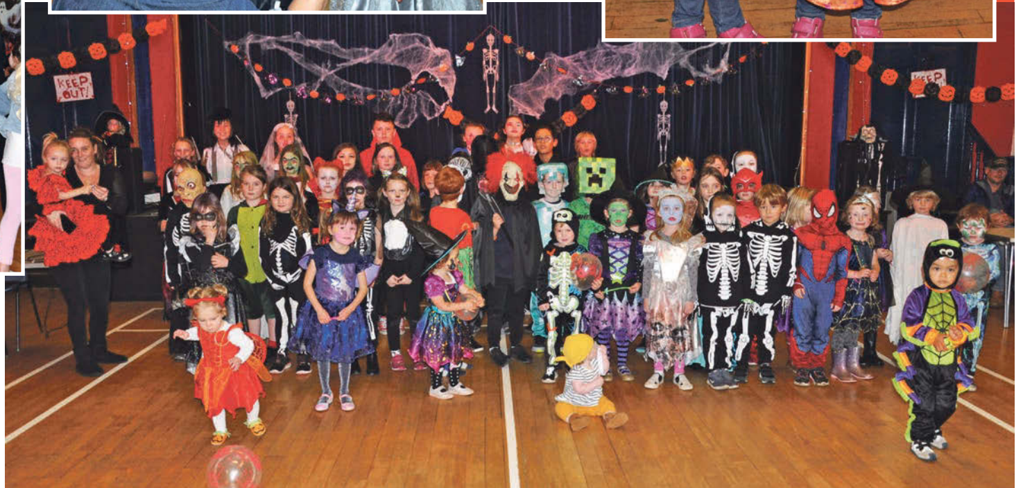
Whiting Bay children pose for a group photograph at their Hallowe'en party. 01_B45Halloween18