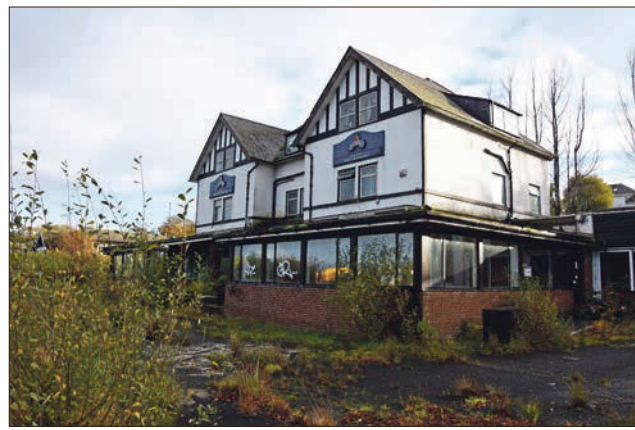
The derelict McLaren Hotel site this week. 01_B45mclaren01

Hope was fading this week that any end was in sight to the McLaren Hotel saga.