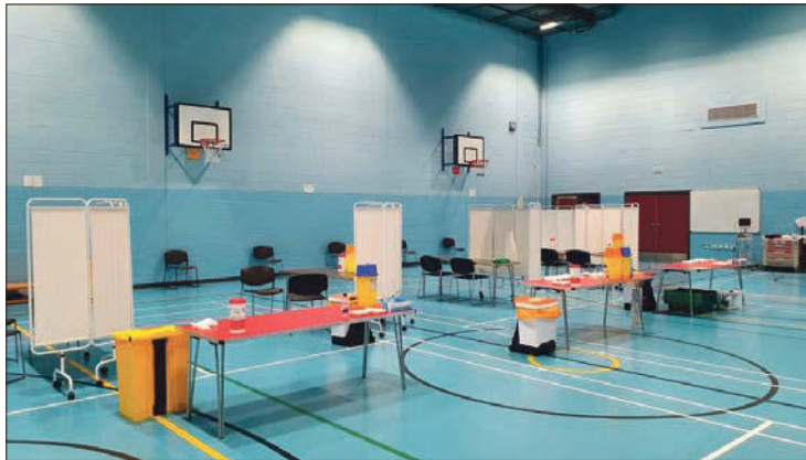
Arran High School sports hall was used for the booster jabs at the weekend.

If you are in any of these categories, and it has been at least 24 weeks since your second vaccination, you can make an appointment by calling the surgery on 01770 600516 after 2pm on weekdays.