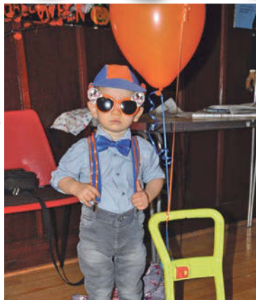
Dressed as Mr Blippi, a young boy poses for the camera.