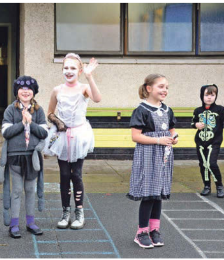
Above: Costume winners receive their prizes at Lamlash Primary. 01_B45Halloween31