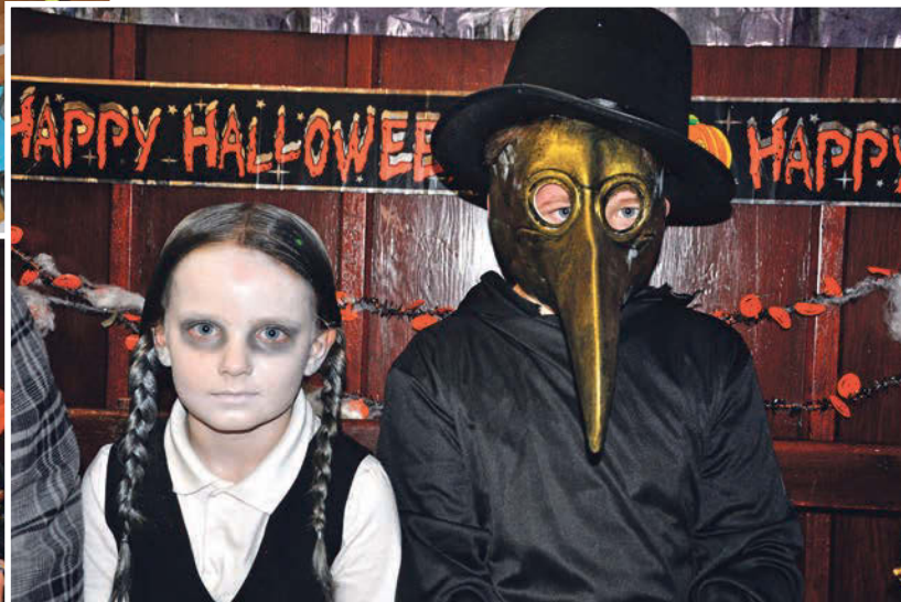
Left: Wednesday Addams and a plague doctor at the Shiskine party.