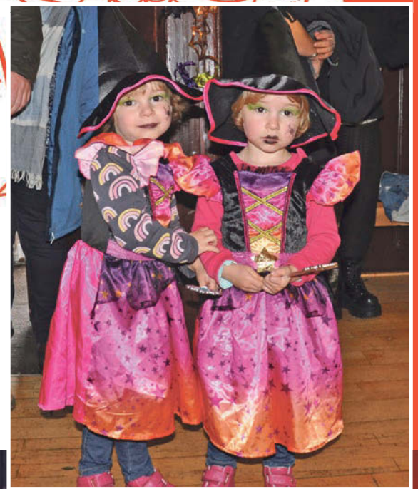
Right: Double trouble, two wee witches at Shiskine's party. 01_B45Halloween12