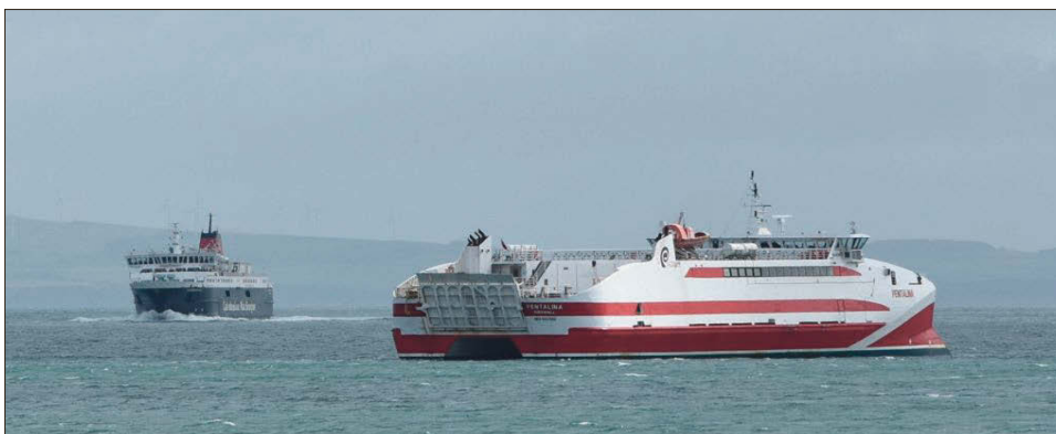
Catamaran MV Pentalina passes MV Caledonian Isles in Brodick Bay during trials earlier this year in anticipation of a leasing deal. A deal with owners Pentland Ferries was not reached.

The steel-hull catamaran vessel, built at a cost of £14.5