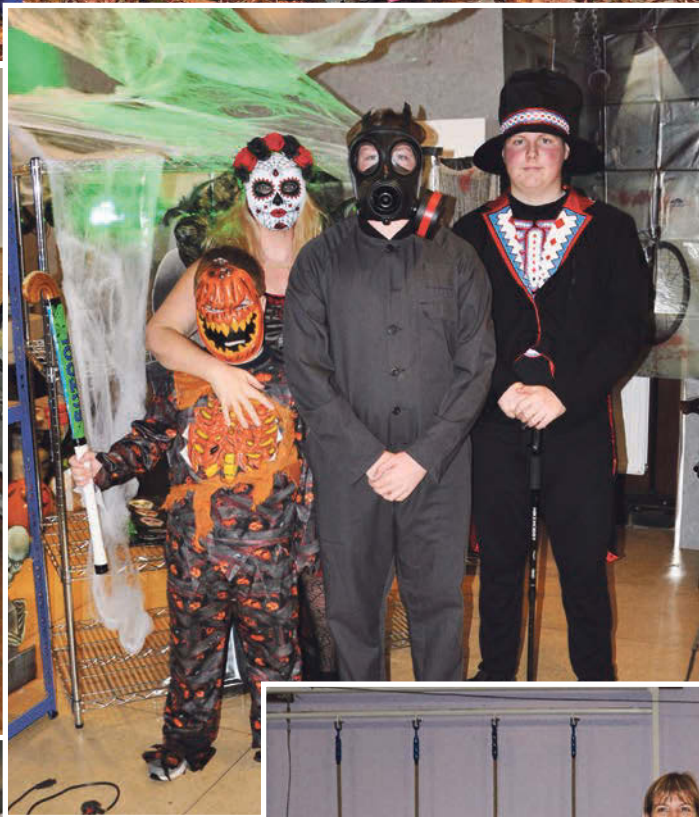
Brodick Early Years pupils enjoyed a dressing up day for Hallowe'en. No_B45Halloween32