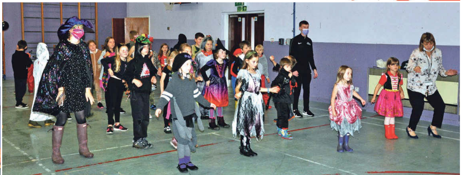
Above: Lamlash Primary teachers join pupils in a number of action dances. 01_B45Halloween16