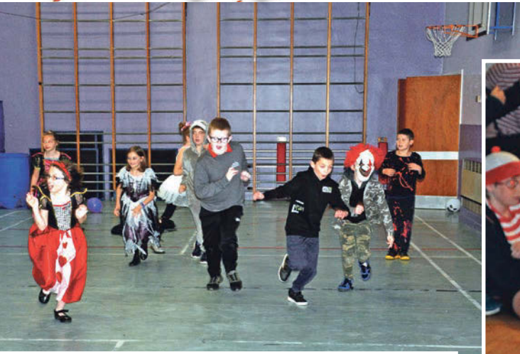
Left: Lamlash Primary pupils excitedly dodge the pumpkin ball. 01_B45Halloween10