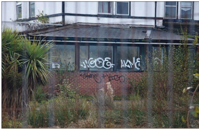
Some of the graffiti which has recently been daubed on the derelict building. 01_B45mclaren02