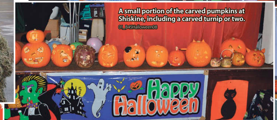
A small portion of the carved pumpkins at Shiskine, including a carved turnip or two.