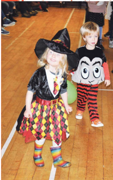
A little witch and pumpkin make their way around Shiskine Hall. 01_B45Halloween14

The Arran Banner visited some of the events, where permissible, and the photos over these pages will provide readers' with a flavour of the celebrations.