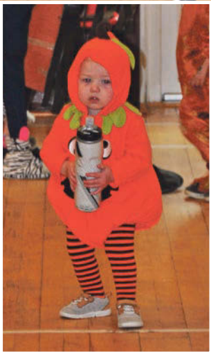
Left: A young girl dressed as a pumpkin takes to the dance floor at Shiskine.