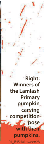
Right: Winners of the Lamlash Primary pumpkin carving competition pose with their pumpkins.