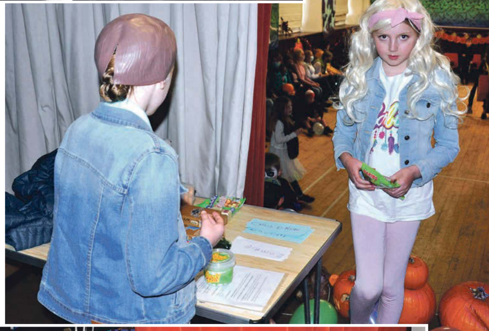
Below: Barbie and Ken collect a prize at Shiskine.