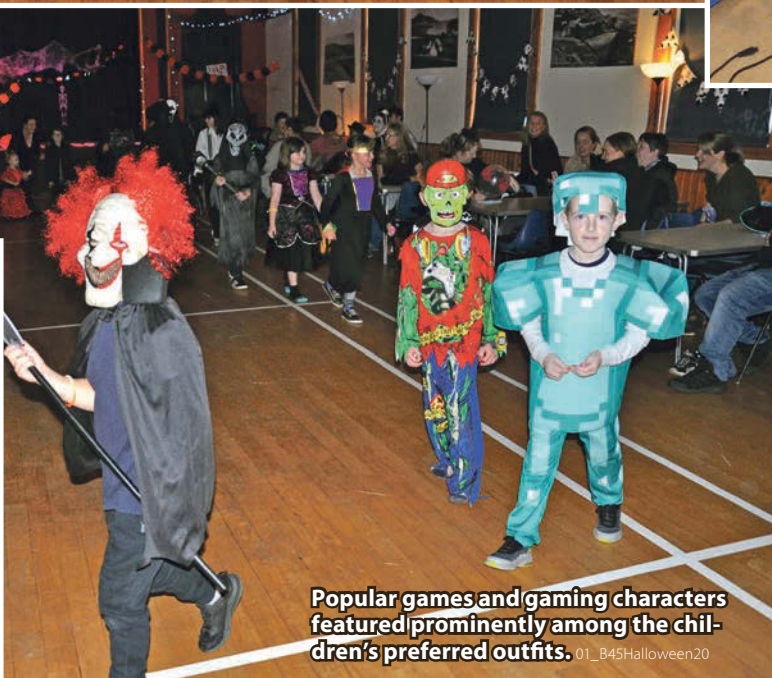
Popular games and gaming characters featured prominently among the children's preferred outfits.