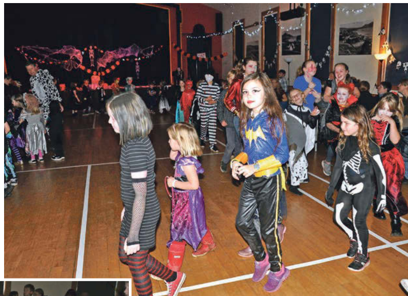
An assortment of scary characters and smiling faces during the Whiting Bay Hallowe'en parade. 01_B45Halloween19