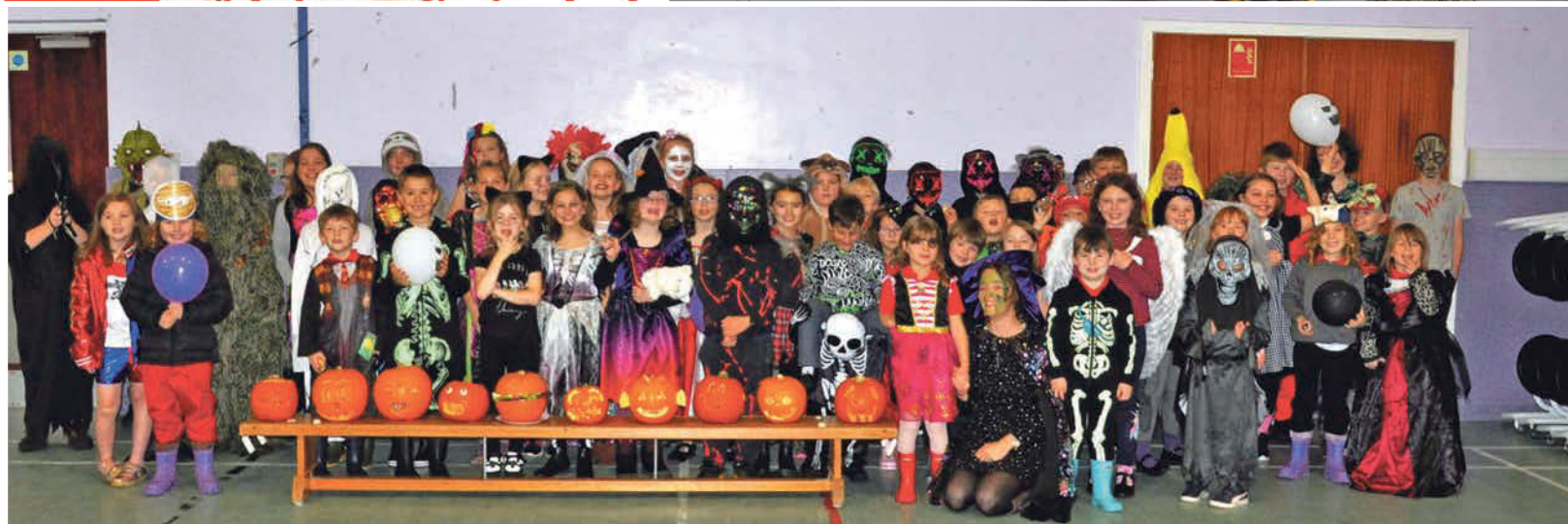
Lamlash Primary pupils pose for a group photograph at their Hallowe'en party. 01_B45Halloween27