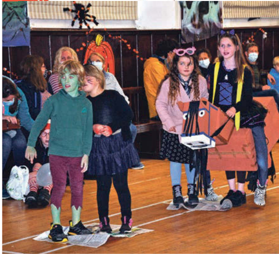
Girls enjoy the Hallowe'en games at Shiskine.