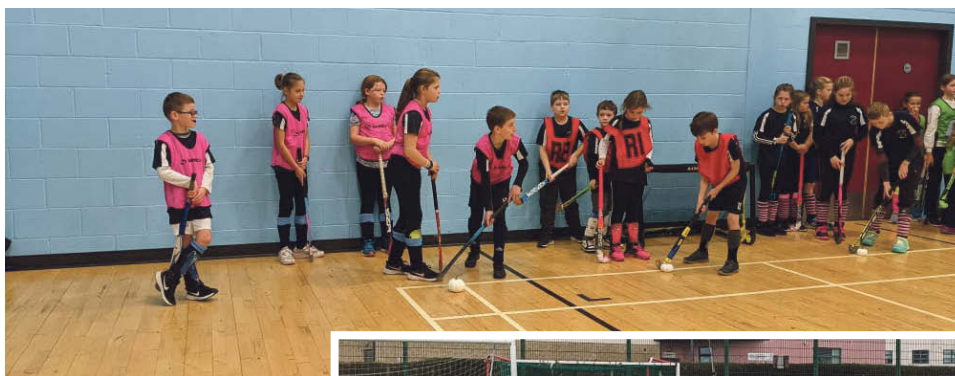
Left, children enjoy a light-hearted warm up using pumpkins.