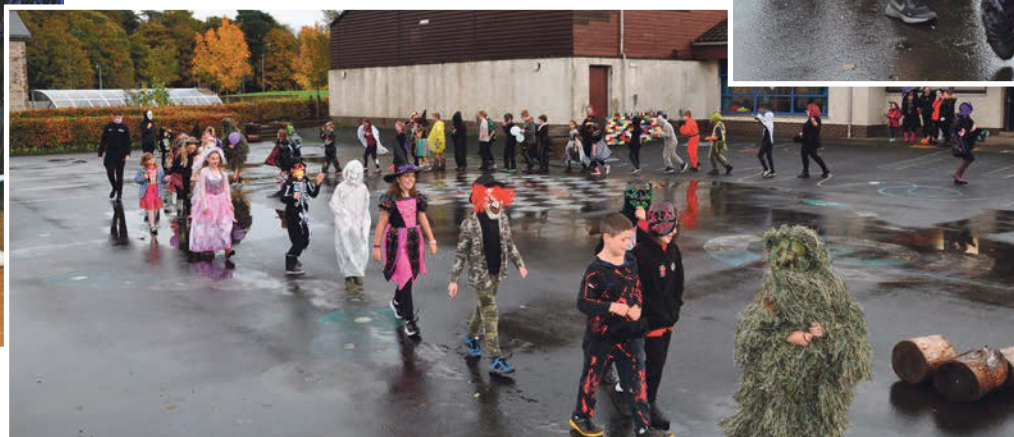
Above and left: After a day packed full of fun activities Lamlash Primary pupils enjoy a Hallowe'en parade accompanied by lively music.