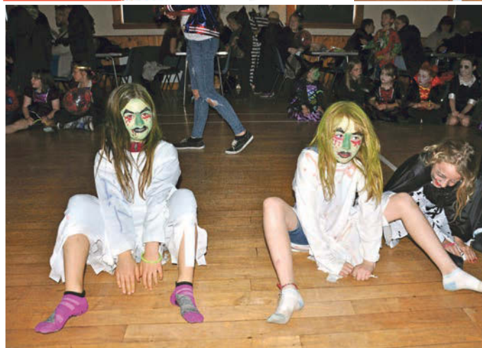
Young girls enjoy the games at Whiting Bay. 01_B45Halloween21