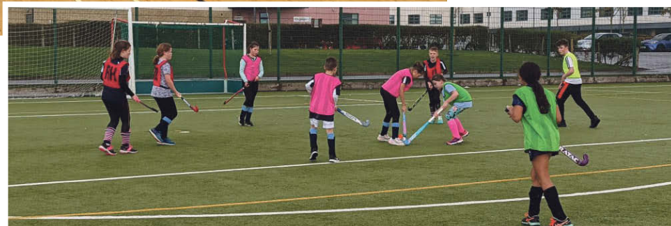
Right, the final match was between Arran and Ardrossan U12.

afterwards at the Waterside Hotel. All welcome. There will be a minibus meeting the ferry and return available for those that need transport.