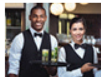
Low resolution will not print well.