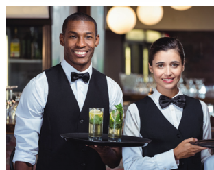
High resolution will print well.